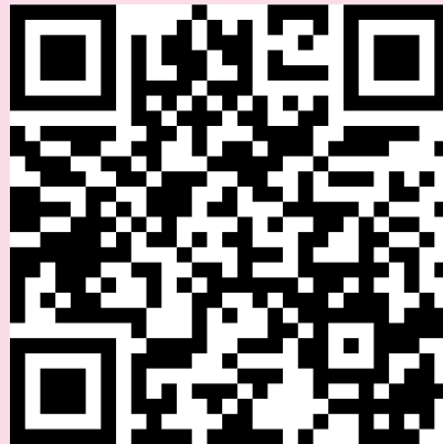
Grit with Grace Goelzer Area Facebook Group