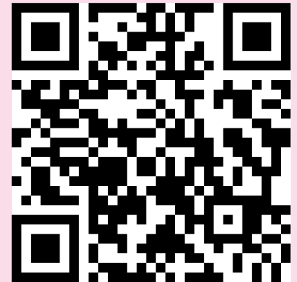
My Mary Kay Facebook Group